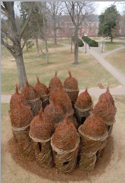
Disorderly Conduct (2011) Guilford College, Greensboro, NC