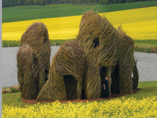
Close Ties, Scottish basketmakers Circle, Dingwall, Scotland